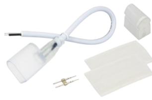
P2-NF-CONKIT-NP 24V power connection kit Includes: (1) 5ft power cord (without plug, without inverter), (1) power pin, (1) end cap and (2) 4" sections of shrink tube