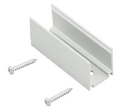
PLR-NF-CLIPS 2" aluminum mounting clips with (2) mounting screws