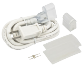
P2-NF-CONKIT-8A 120V power connection kit Includes: (1) 120V AC 5ft power cord with 8A inverter, (1) power pin, (1) end cap and (2) 4" sections of shrink tube