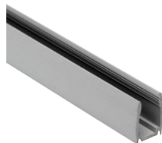
P2-NF-TRACK-4 4ft plastic mounting track 3/4"W x 3/8"H