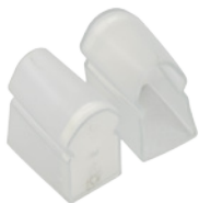
PLR-NF-ENDS Clear plastic end caps (10 per bag)