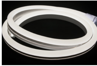
P2-NF-WH (120V) P2-NF-24V-WH (24V) Bright White LEDs • 78CRI Opaque white jacket (120V) 5000K • 63Lm/ft (24V)5000K • 90Lm/ft