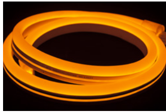
P2-NF-OR (120V) P2-NF-24V-OR (24V) Orange LEDs Opaque amber jacket (120V) 610nm • 12Lm/ft (24V) 606nm • 15Lm/ft