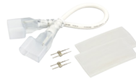
P2-NF-JUMP.5 6" cable P2-NF-JUMP3 3ft cable P2-NF-JUMP10 10ft cable P2-NF-JUMP20 20ft cable Jumper (linking) cables Includes:(2) power pins and (2) 4" sections of shrink tube