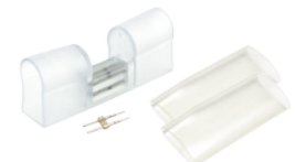
P2-NF-INVS Invisible splice kit Includes: (1) power pin and (2) 4" sections of shrink tube