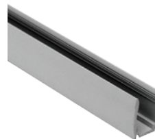
P2-NF-CHAN-3 3ft aluminum mounting track 3/4"W x 3/8"H