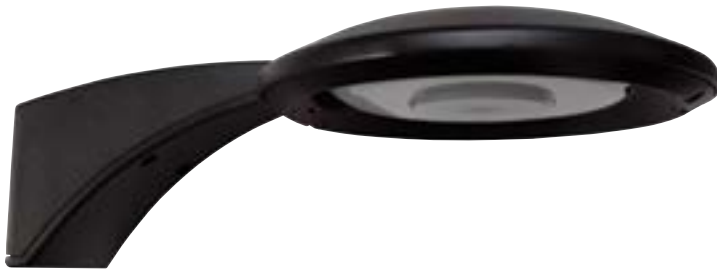
Shown as Square Pole Mount