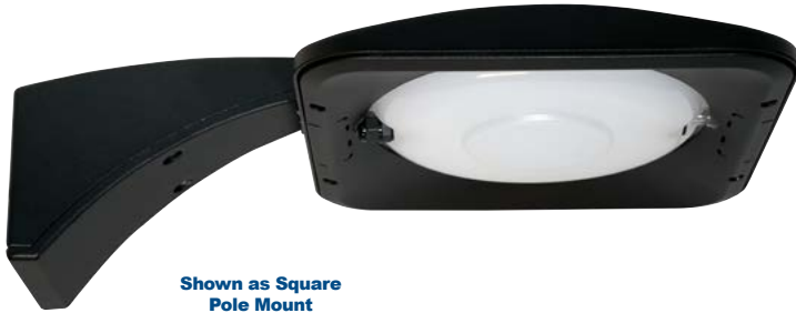
Shown as Square Pole Mount