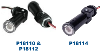
P18110 & P18112